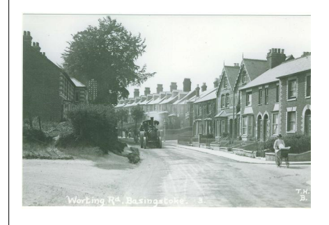
Continued on Page 4 >