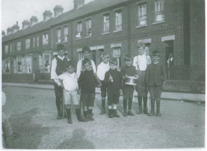
George Street Boys—You here? Continued on Page 4 >