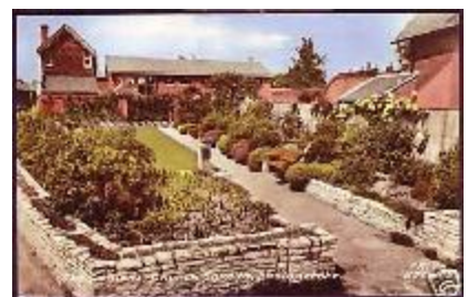
Church Square Rotarian Herb Garden: Please send us the original planting plans for restoration!