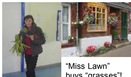
"Miss Lawn" buys "grasses"!

The plant sales raised over £50 for Hall funds, and some residents signed up on the spot to enter the competition! Everyone who receives a Blurb can enter their front garden, tub or hanging basket! We have some great displays in Brookvale - So don't be shy - Let everyone know about your displays and gardens!