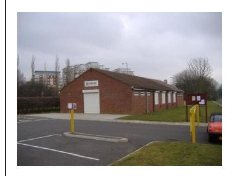
Continued on Page 4 >