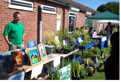
Continued on Page 4 >