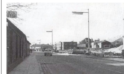
Where is this?