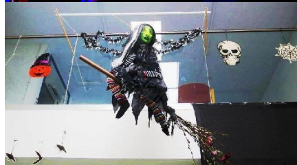
A great evening, over 70 attended!