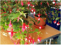
2019 Fuschia Entries

Brookvale Village Hall 26th July 2020 at 3pm: