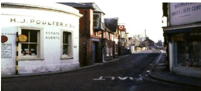
Where was this?