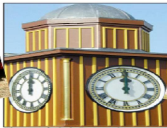
Thornycroft clock, Basingstoke