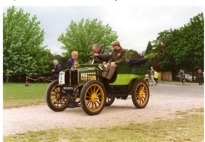
Continued on Page 4 >

In 1908 the Thornycroft car came 5<sup>th</sup> at 44.1mph, a very creditable speed for those days!