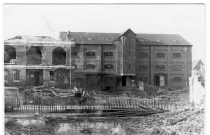
Where was this?