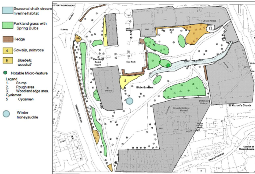
Loddon Vale Parks : Glebe Gardens - Spring Bulbs & planned plants

BCA welcome your Ideas and look forward to your offers of Volunteering to :