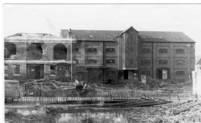
Where was this?

“We wanted to do something positive to help the bees and butterflies in our local community, so we planted a bee border. We can all help out in a small way by planting a tub with scented flowers like lavender, thyme or single flowering plants. This garden has been created and is maintained by local volunteers.”