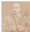
Who & where was this?

Transcripts of the Police Superintendent's diary are enhanced with contemporary newspaper reports providing us with an entertaining and compelling back-story of Basingstoke's colourful past: