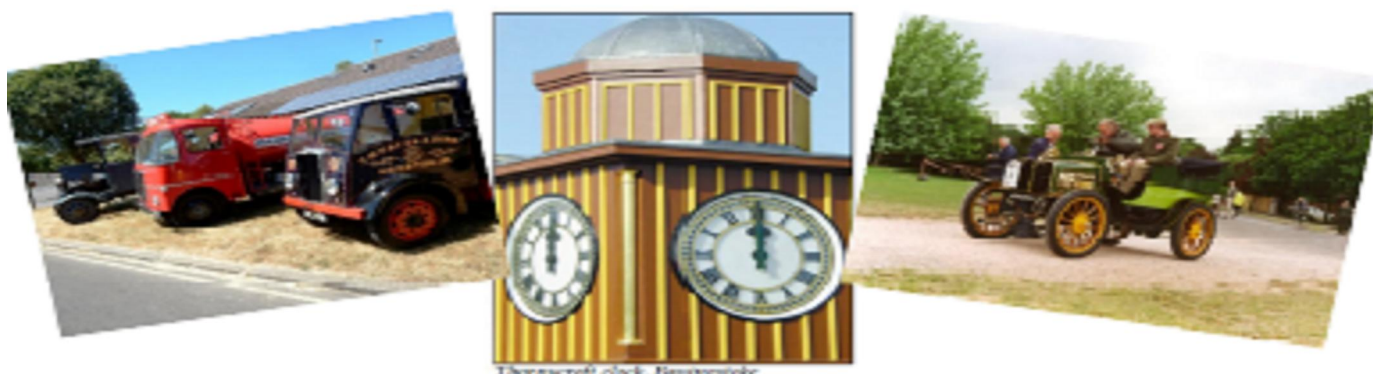
Thornycroft clock, Basingstoke

Midday- 4pm Brookvale Village Hall RG21 7RP