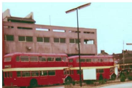
Where was this?